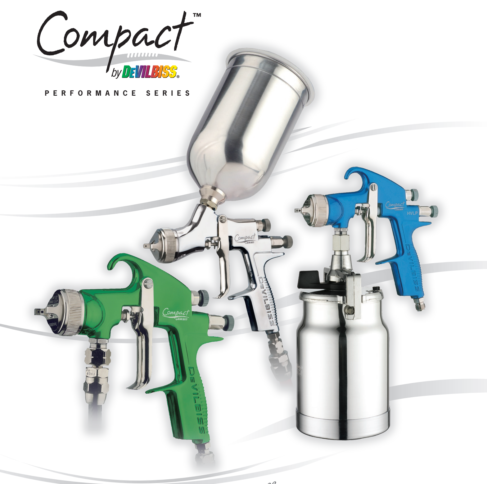
Feel the Comfort Spray the Difference